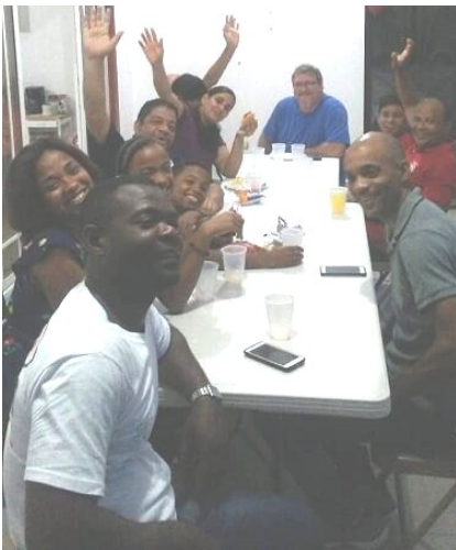
La Canela Church Planting Team